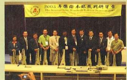
International Woodball Referee Seminar 22~24 September 2003; Taipei, Taiwan