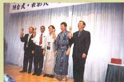
The 2nd Japan Open Woodball Championship 18~19 October 2003; Fukushima, Japan