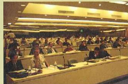
International Woodball Referee Seminar 22~24 September 2003; Taipei, Taiwan