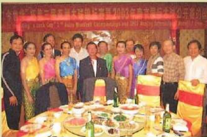
The 3rd Asian Woodball Championship 25~31 October 2003; Nanking, China