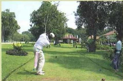
The 7th Malaysia Woodball International Open Championship 6~12 August 2003; Lanjut, Malaysia