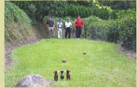
The International Woodball Invitation Championship 2003 27~28 September 2003; Taipei, Taiwan