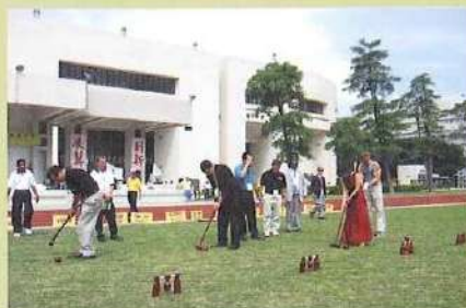
The International Woodball Invitation Championship 2003 27~28 September 2003; Taipei, Taiwan