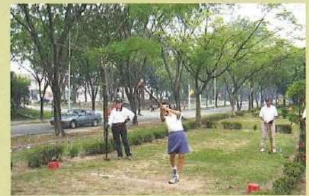
The 8th Malaysia International Open Championship 11~16 September 2004; Kuala Lumpur, Malaysia