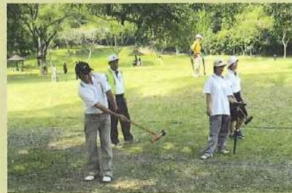
The 5th Woodball Association Cup International Open Championship 2004 6~11 September 2004; Singapore