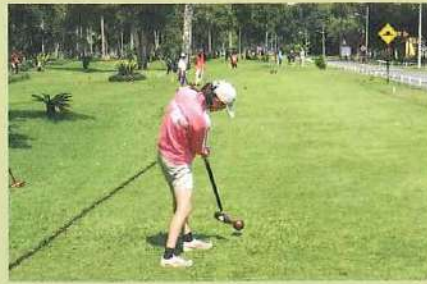
The 3rd Asian University Woodball Championship 6~12 August 2003; Lanjut, Malaysia