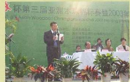
The 3rd Asian Woodball Championship 25~31 October 2003; Nanking, China