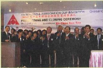
The 4th Woodball Association Cup Woodball Invitation Championship 1~6 August 2003; Singapore