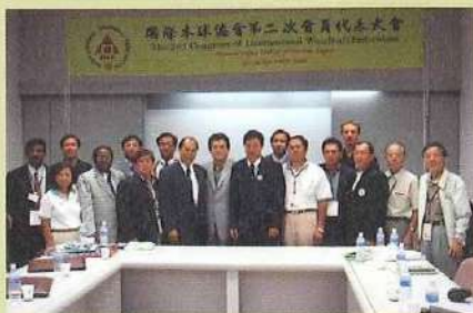
The 3rd General Assembly of International Woodball Federation 25~26 September 2003; Taipei, Taiwan