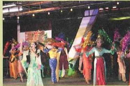
The 7th Malaysia Woodball International Open Championship 6~12 August 2003; Lanjut, Malaysia