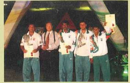
The 3rd Asian University Woodball Championship 6~12 August 2003; Lanjut, Malaysia