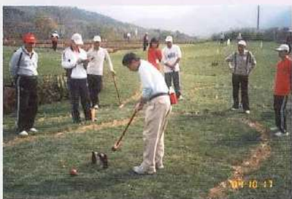
China International Woodball Open Tournament 2004 14~19 Oct. 2004; Beijing, China