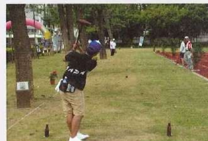
The 1st World University Woodball Championship 3 Sep.~7 Sep. 2004; Taipei, Taiwan