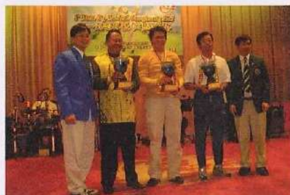
The 1st World Cup Woodball Championship 2004 8 Sep.~12 Sep. 2004; Taipei, Taiwan