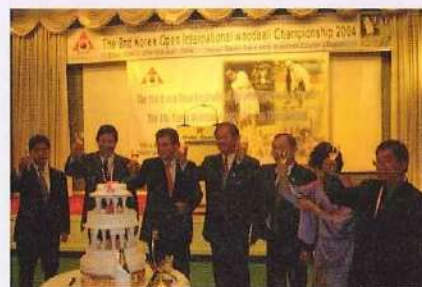
The 2nd Korea Open International Woodball Championship 2004 20 Oct.~25 Oct. 2004; Suwon, Korea