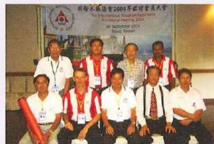
The International Woodball Federation Provisional Meeting 2004 10 Sep. 2004; Taipei, Taiwan