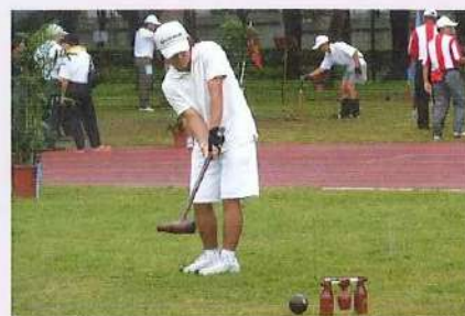
The 1st World Cup Woodball Championship 2004 8 Sep.~12 Sep. 2004; Taipei, Taiwan