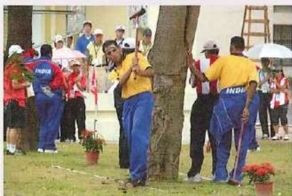
The 1st World Cup Woodball Championship 2004 8 Sep.~12 Sep. 2004; Taipei, Taiwan