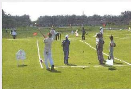
"Embassy Cup 2004" Woodball Invitational Tournament 20 May 2004; Beijing, China