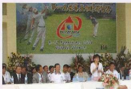
The 1st World Cup Woodball Championship 2004 8 Sep.~12 Sep. 2004; Taipei, Taiwan