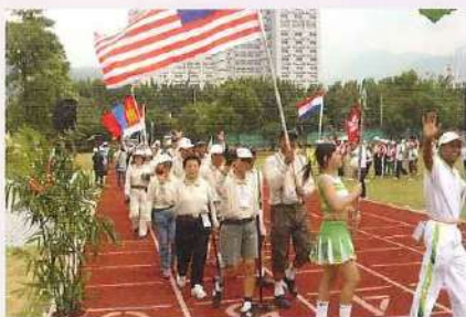
The 1st World Cup Woodball Championship 2004 8 Sep.~12 Sep. 2004; Taipei, Taiwan