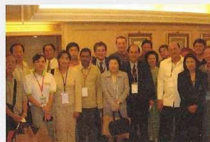
The 1st World Cup Woodball Championship 8 Sep.~12 Sep. 2004; Taipei, Taiwan