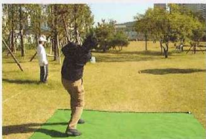
The 2nd Korea Open International Woodball Championship 2004 20 Oct.~25 Oct. 2004; Suwon, Korea