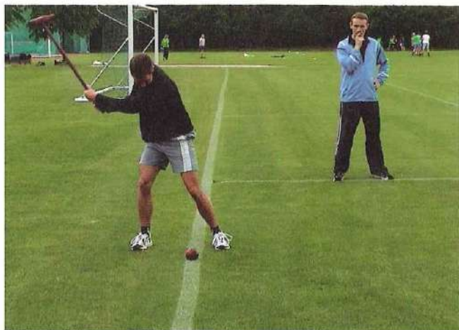
Student practices woodball swing