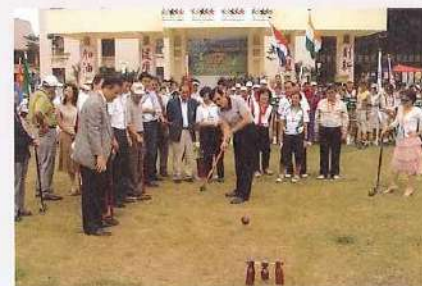
The 1st World Cup Woodball Championship 2004 8 Sep.~12 Sep. 2004; Taipei, Taiwan