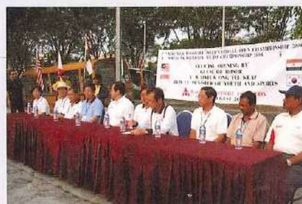
The 8th Malaysia Woodball International Open Championship 11 Aug.~16 Aug. 2004; Kuala Lumpur, Malaysia