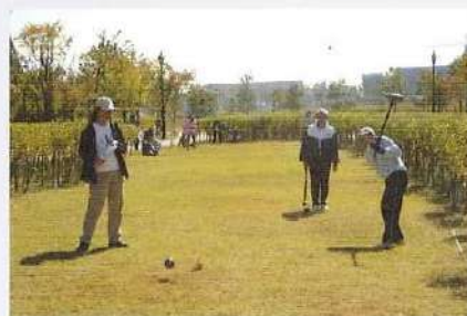
The 2nd Korea Open International Woodball Championship 2004 20 Oct.~25 Oct. 2004; Suwon, Korea