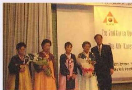
The 2nd Korea Open International Woodball Championship 2004 20 Oct.~25 Oct. 2004; Suwon, Korea