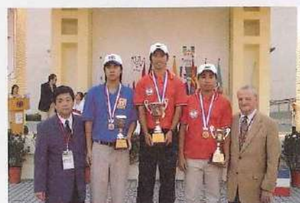
The 1st World Cup Woodball Championship 8 Sep.~12 Sep. 2004; Taipei, Taiwan