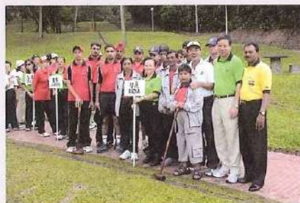
The 5th Woodball Association Cup International Open Championship 2004 6 Aug.~11 Aug. 2004; Singapore