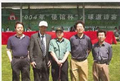
"Embassy Cup 2004" Woodball Invitational Tournament 20 May 2004; Beijing, China