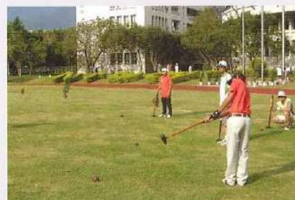
The 1st World University Woodball Championship 3 Sep.~7 Sep. 2004; Taipei, Taiwan