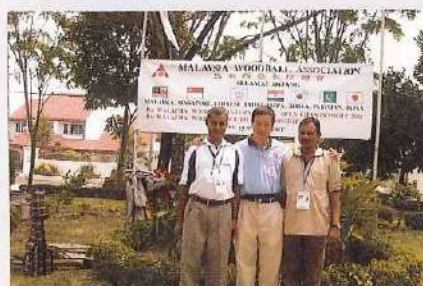
The 8th Malaysia Woodball International Open Championship 11 Aug.~16 Aug. 2004; Kuala Lumpur, Malaysia