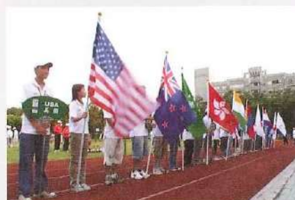
The 1st World University Woodball Championship 3 Sep.~7 Sep. 2004; Taipei, Taiwan