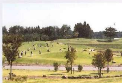
The 3rd Japan Woodball Open Championship 1 Oct.~4 Oct. 2004; Fukushima, Japan