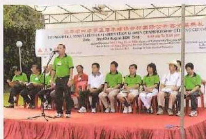
The 5th Woodball Association Cup International Open Championship 2004 6 Aug.~11 Aug. 2004; Singapore