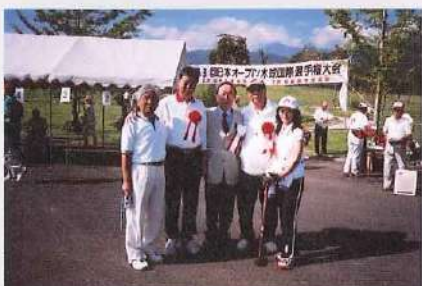
The 3rd Japan Woodball Open Championship 1 Oct.~4 Oct. 2004; Fukushima, Japan