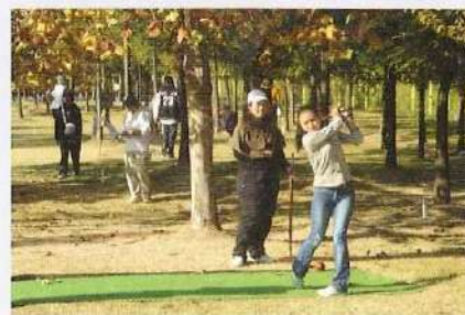
The 2nd Korea Open International Woodball Championship 2004 20 Oct.~25 Oct. 2004; Suwon, Korea