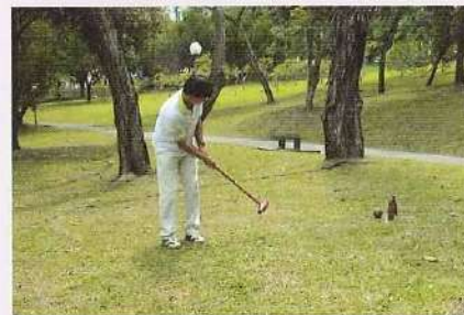
The 5th Woodball Association Cup International Open Championship 2004 6 Aug.~11 Aug. 2004; Singapore