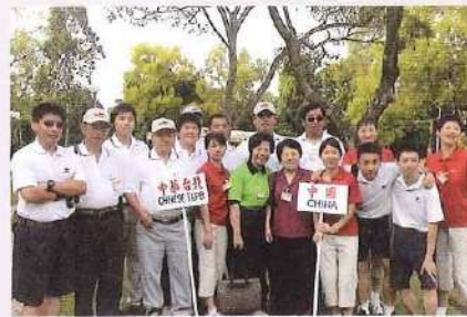
The 5th Woodball Association Cup International Open Championship 2004 6 Aug.~11 Aug. 2004; Singapore