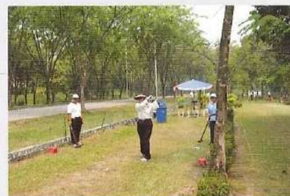
The 8th Malaysia Woodball International Open Championship 11 Aug.~16 Aug. 2004; Kuala Lumpur, Malaysia