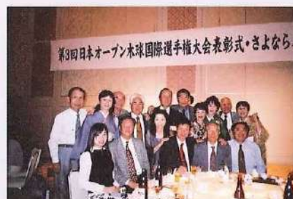
The 3rd Japan Woodball Open Championship 1 Oct.~4 Oct. 2004; Fukushima, Japan