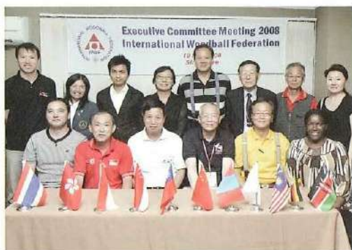
IWBf Executive Committee Meeting 2008 國際木球總會執行委員會會議 19-20 May 2008 : Singapore