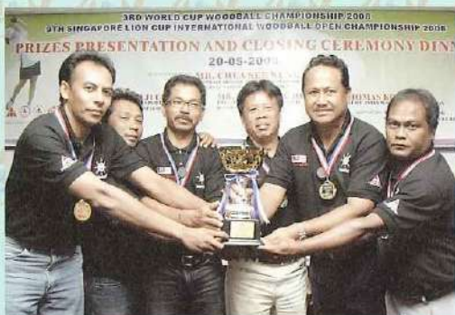
3rd World Cup Woodball Championship 2008 / International Tour - 3rd World Cup Stop 2008年第三屆世界盃木球錦標賽/國際木球巡迴賽-世界盃 16-21 May 2008 : East Coast Park, Singapore