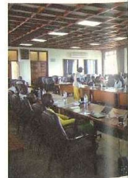
Uganda Woodball Clinic 2008 2008年烏干達木球講習會 12-13 July 2008 : Kampala