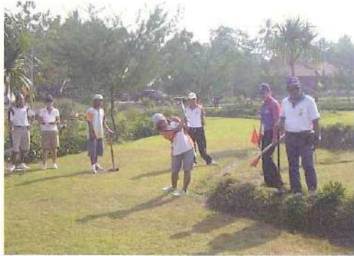
2nd Indonesia Open International Sandy - Grass Woodaball Championship 2008 / International Tour - Indonesia Stop 2008年第二屆印尼沙灘草地國際木球公開賽/國際木球巡迴賽-印尼站 26 June - 1 July 2008 : Central Java, Indonesia