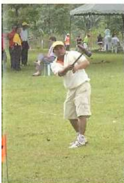
Malaysia Open Championship 2008 / International Tour - Malaysia Stop 2008馬來西亞木球公開賽/國際木球巡迴賽-馬來西亞站 Kuala Lumpur, Malaysia