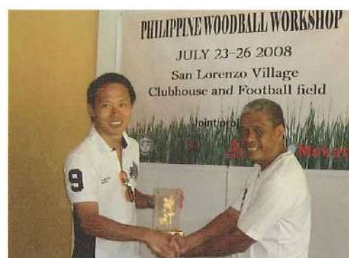
Philippine Woodball Workshop 2008 2008年菲律賓木球講習會 23-26 July 2008 : Manila, Philippines