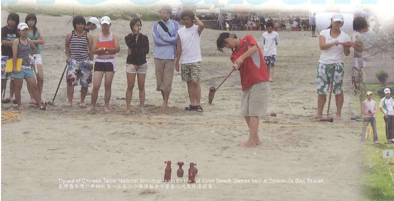
Try-out of Chinese Taipei National Woodball team for the 1st Asian Beach Games held at Emerald Bay, Taiwan 臺灣翡翠灣所舉辦的第一屆亞洲沙灘運動會中華臺北代表隊選拔賽

WOODBALL TRAVEL TO EVERY COUNTRY AROUND THE WORLD CREATING INTERNATIONAL FRIENDSHIP AND EXCHANGE INTERNATIONAL CULTURE AND UNDERSTANDING AMONGST PEOPLE IN THE WORLD.