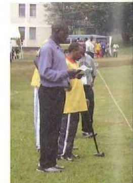
5th All Africa University Games 第五屆全非洲大學運動會 6-16 July 2008 : Kampala