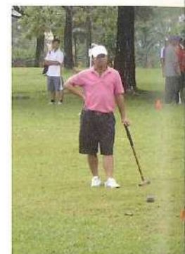
12th Malaysia Woodball International 2008年第12屆馬來西亞木球國際賽 20-25 August 2008 : Kuala Lumpur