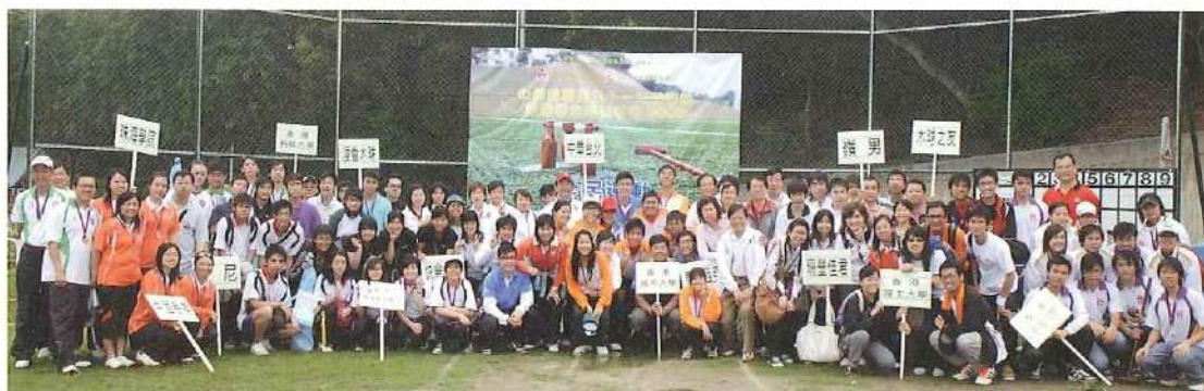
Hong Kong Woodball Open Championship 2008 / International Tour - Hong Kong Stop 2008香港木球公開賽/國際木球巡迴賽-香港站 13 April 2008 : University of Science & Technology, Hong Kong