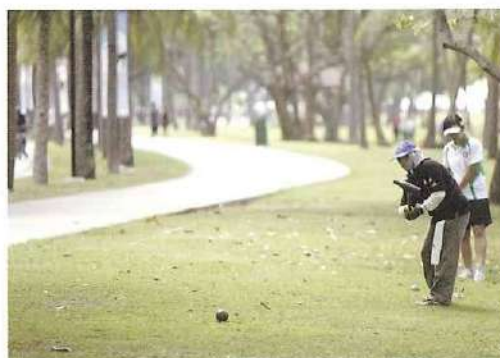
9th Singapore Lion Cup International Woodball Open Championship 2008 / International Tour - S 2008年第九屆新加坡獅城盃木球公開賽/國際木球巡迴賽-新加坡站 16-21 May 2008 : East Coast Park, Singapore