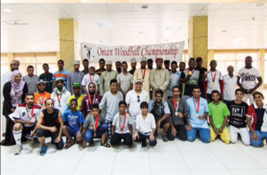
Omani Committee Beach Games Triple Third Championship, September 2016