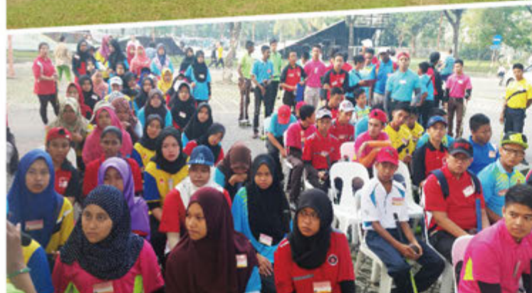
Malaysia National Woodball Open Championship 2016, Taman Metropolitan Batu, Kuala Lumpur, 8-10 April 2016