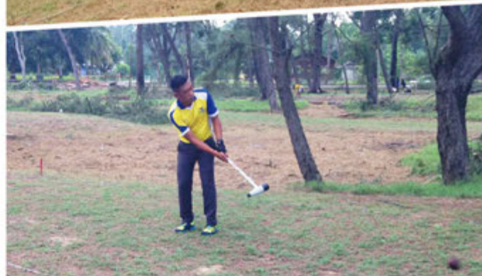
Kelab Woodball Kuala Rompin 2016, Laman Woodball Pantai Hiburan Rompin, Pahang, 22-23 October 2016