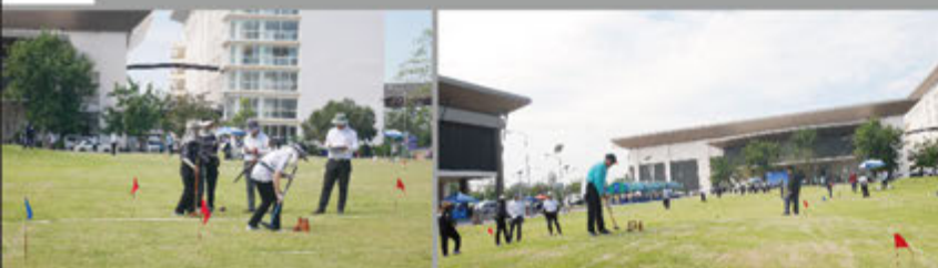
Woodball Thailand Championship 2016