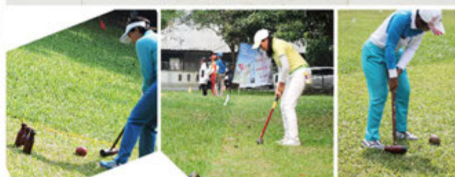
National Championship, Lapangan Woodball, Pamulang, Tangerang Selatan, 2-5 June 2016