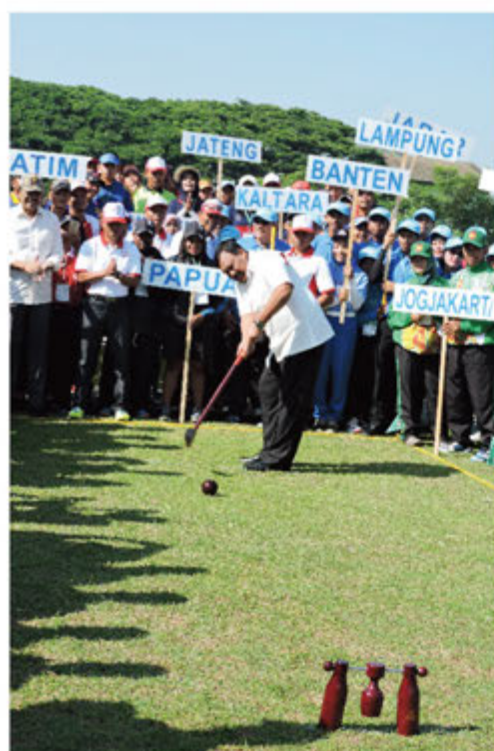
Exhibition PON XIX, Pusdiklav, Jl. Letkol G.A. Manulang No. 1 Padalarang, Bandung Barat, 2-5 September 2016