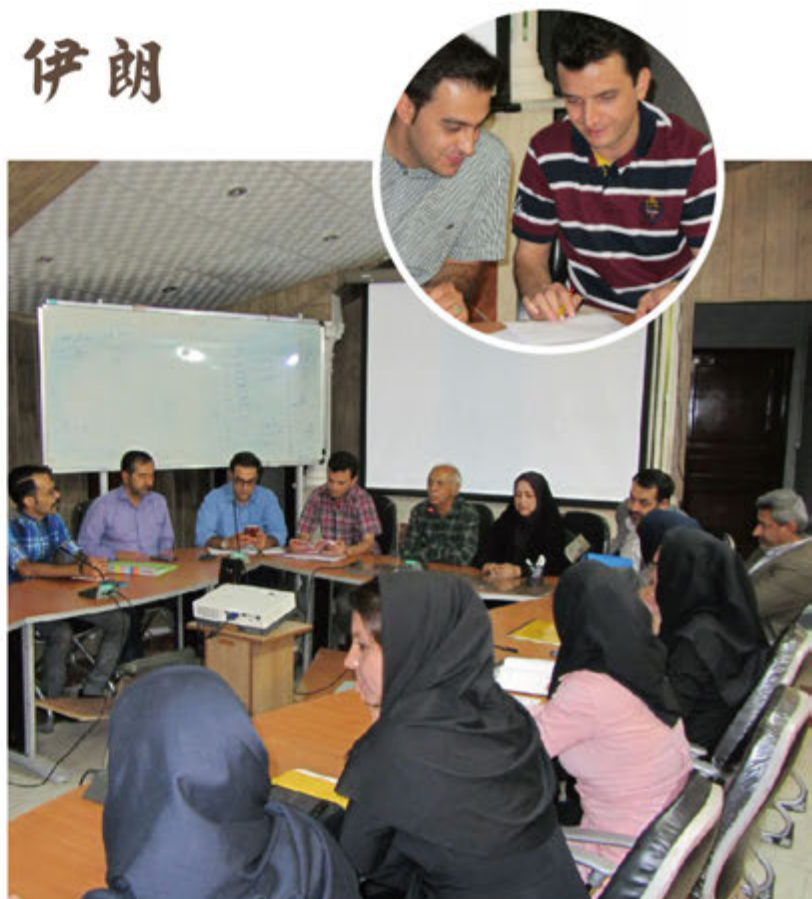
Refereeing Course, Fars Province, Melal Horse-riding Complex, 28-30 September 2016