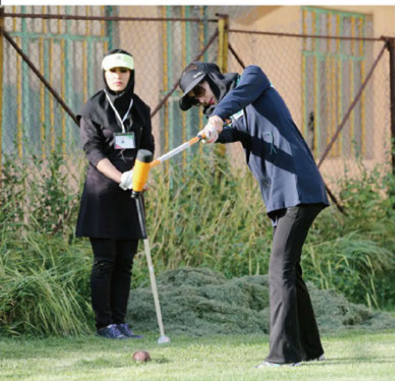
National Team Training Camp 2016, Kermanshah Province, 10-14 May 2016