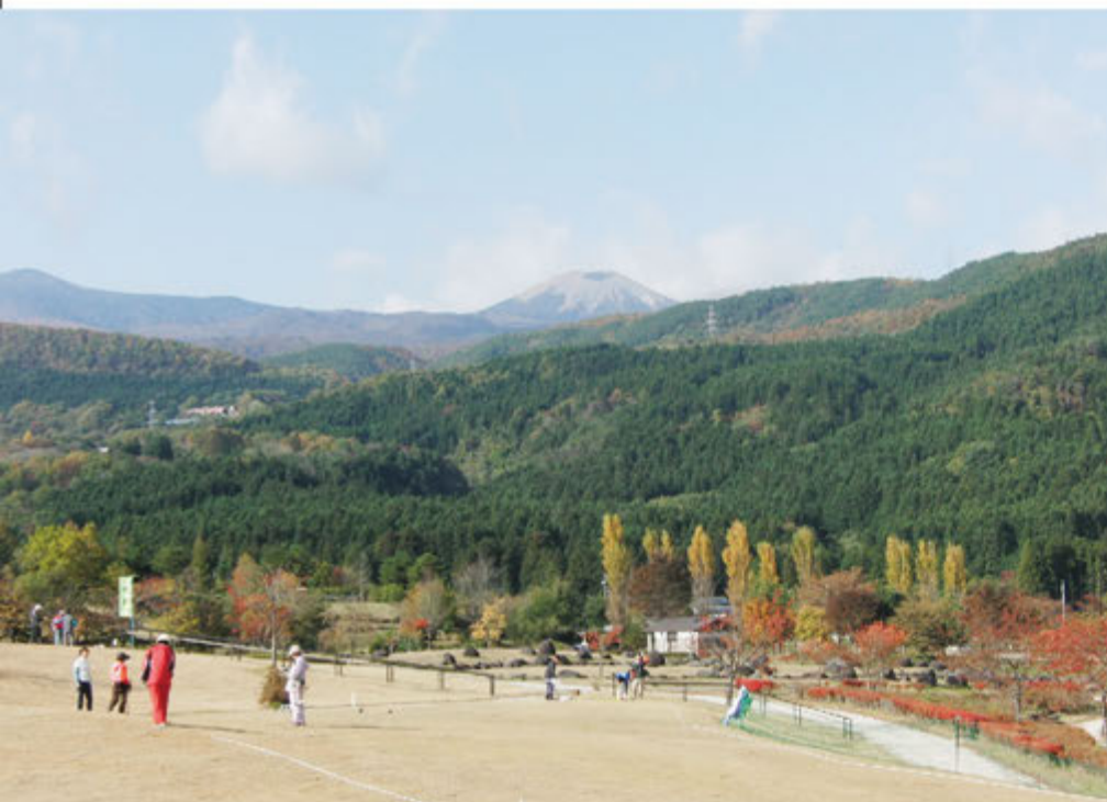
11th Japan Woodball Championship, Azuma Sports Park in Fukushima 6 November 2016