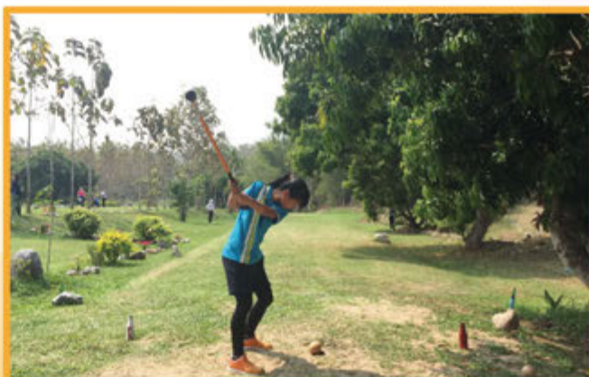
9th Thailand Open International Woodball Championship 2016 2016年第九屆泰國國際木球公開賽 Chiang Mai, Thailand 22 - 27 Feb. 2016