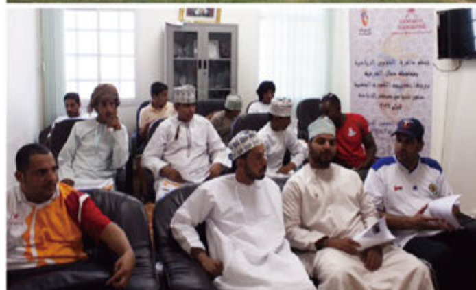
Ibra Training Workshop, Ibra, 27 May 2016