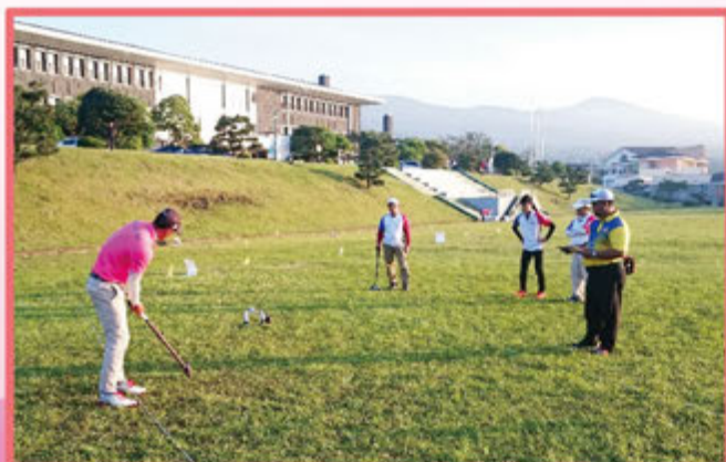
5th Korea Open International Woodball Championship 2016 2016年第五屆韓國國際木球公開賽 Jeju, Korea 25 - 31 May 2016