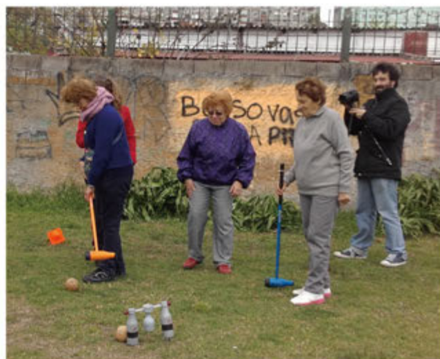
Montevideo Neighborhood La Virgen, Municipality E, September 2016