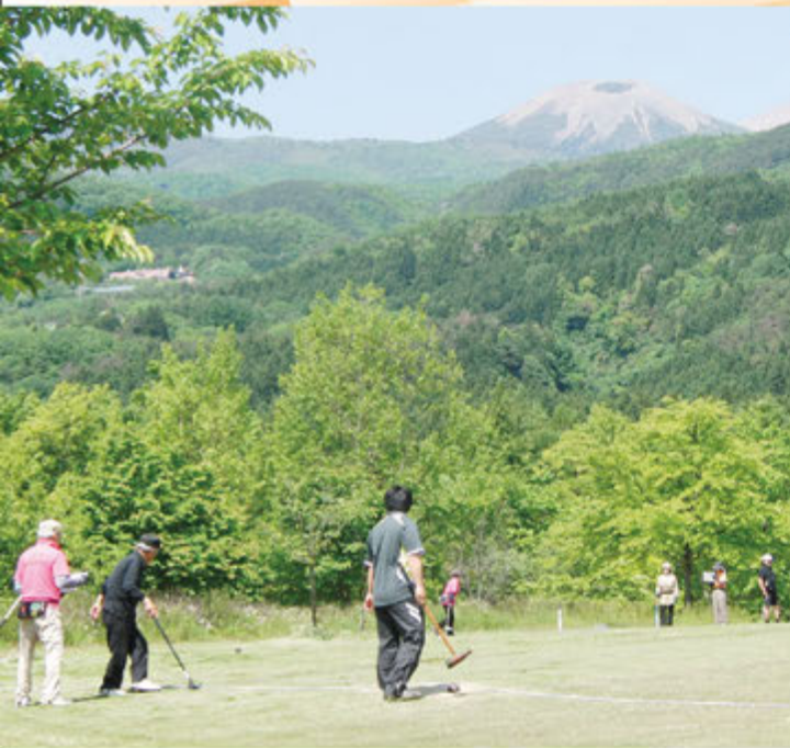
45th Fukushima Pre. Woodball Championship, Azuma Sports Park in Fukushima, 22 May 2016