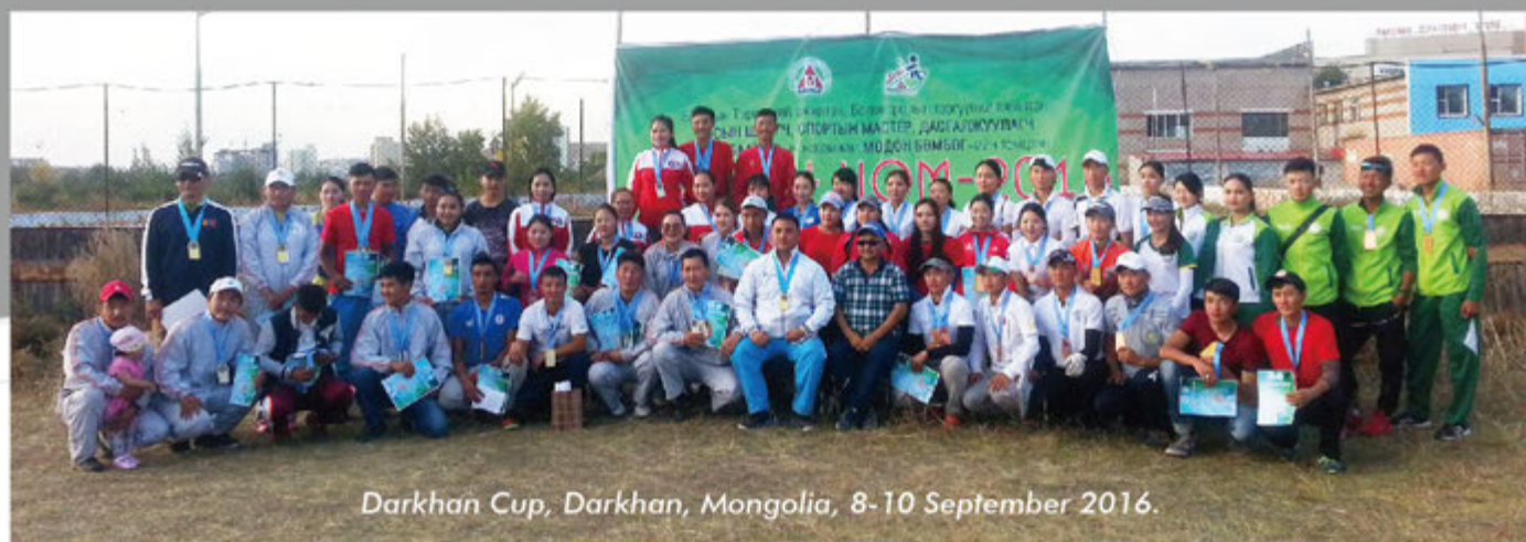
Darkhan Cup, Darkhan, Mongolia, 8-10 September 2016.