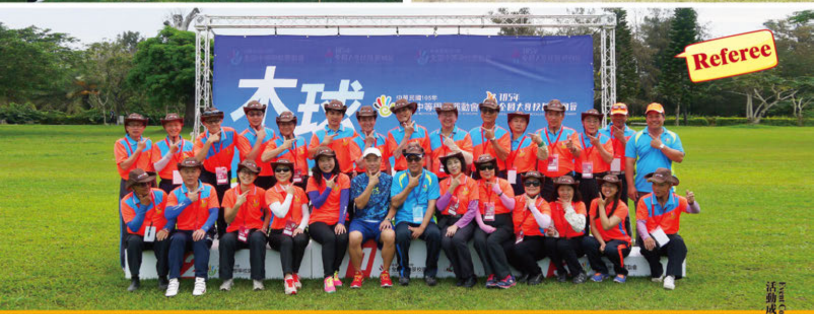
中華民國105年全國中等學校運動會 Taiwan National High School Games 2016, 23-28 Apr. 2016