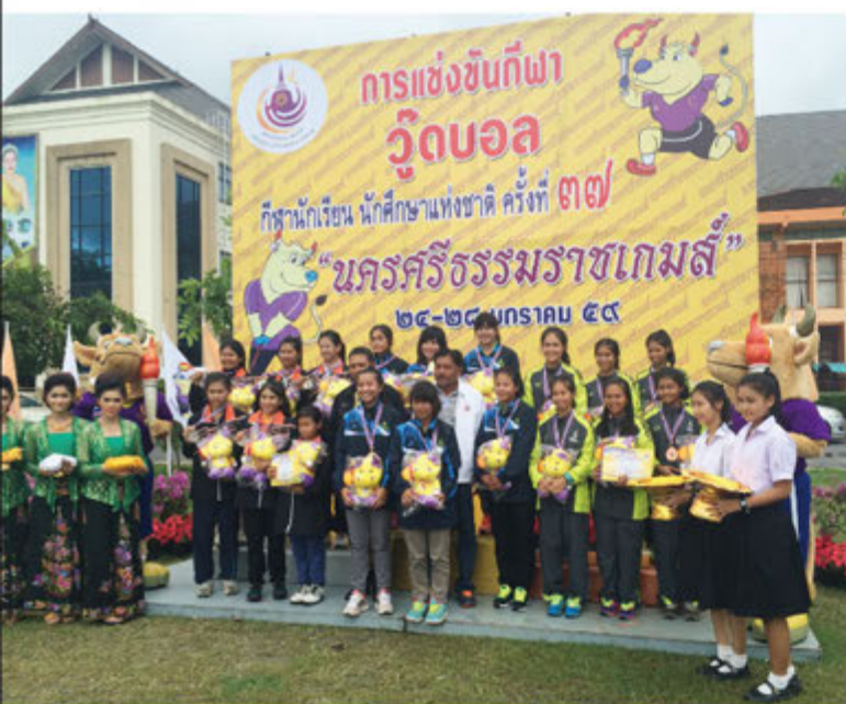
National Student Sport Games 2016