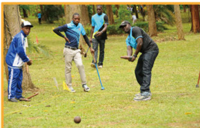
4th Uganda Open International Woodball Championship 2016 2016年第四屆烏干達國際木球公開賽 Entebbe, Uganda 18 - 19 Mar. 2016