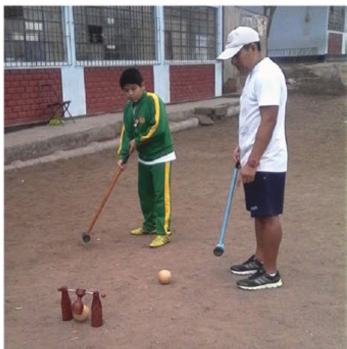
Woodball Training Camp in Swiss Peruvian School, Lima, Peru, August 2016