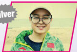
Li Yifeng China