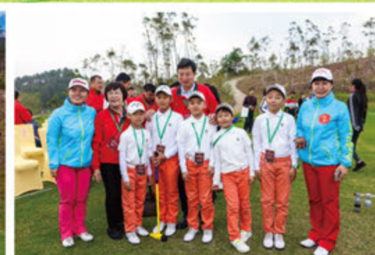
11th China National Woodball Tournament, Heyuan, Guangdong, 6-9 December 2016