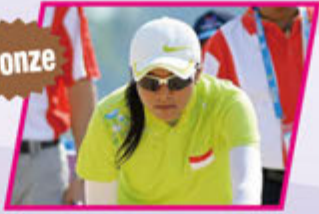
Dwi Tiga Putri Indonesia