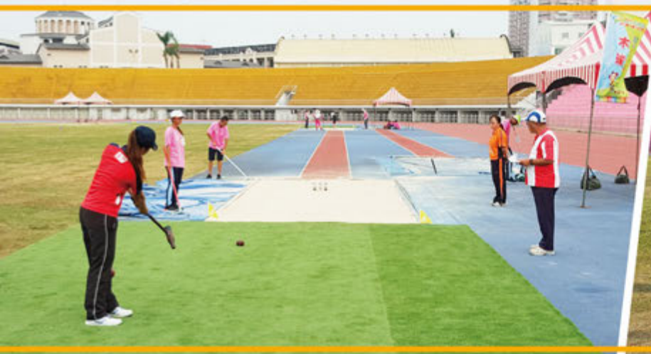
中華民國105年全民運動會 Sport for All Games 2016, 5-9 Nov. 2016