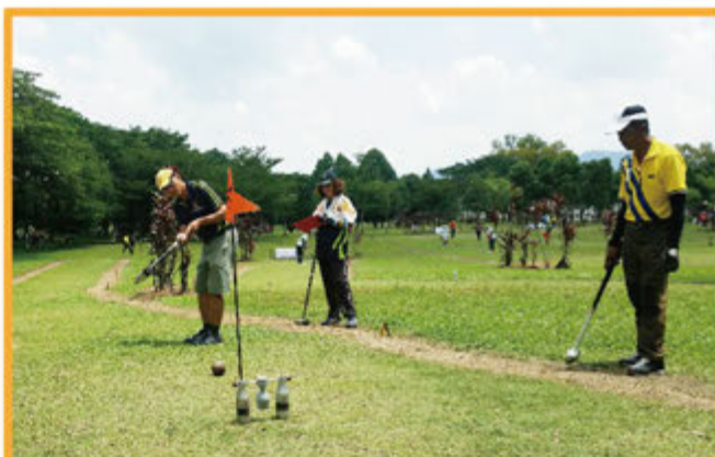
19th Malaysia Open International Woodball Championship 2016 2016年第十九屆馬來西亞國際木球公開賽 Kuala Lumpur, Malaysia 30 Jul. - 4 Aug. 2016