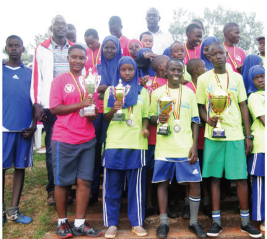
7th ICPAU Juniors Woodball Championship, King's College Budo, 11 June 2016