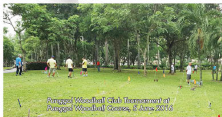
Punggol Woodball Club Tournament at Punggol Woodball Course, 5 June 2016