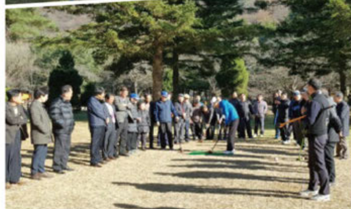
Boeun woodball course opens Boeun woodball course, 15 Nov. 2016