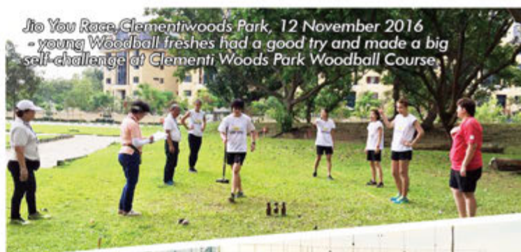
Jio You Race, Clementi Woods Park, 12 November 2016 - young Woodball freshes had a good try and made a big self challenge of Clementi Woods Park Woodball Course.