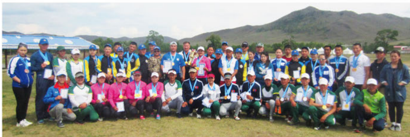
National Woodball Championship, Mongolian Hotel of Gachuurt Village, 12-14 June 2016