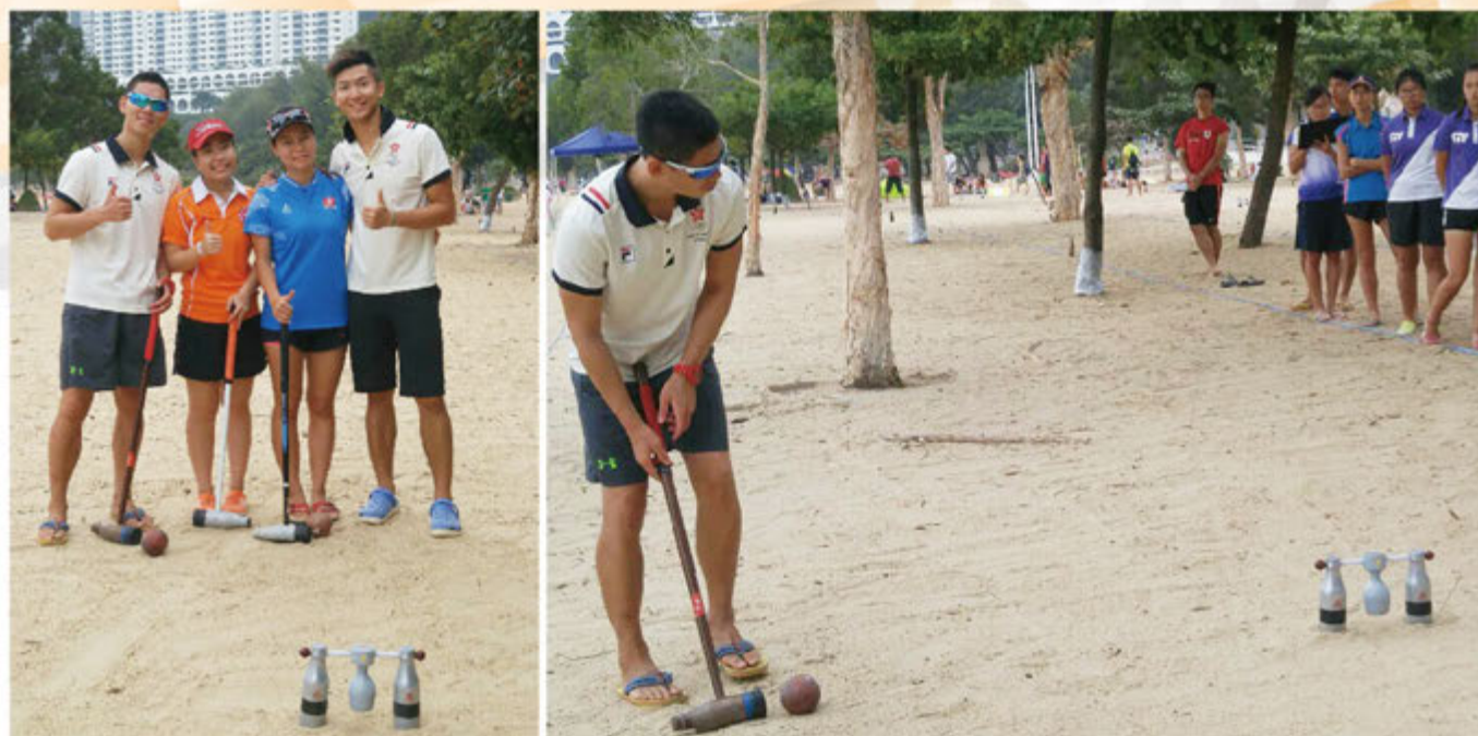
4th Hong Kong Southern District Beach Games-Beach Woodball Tournament, 23 October 2016