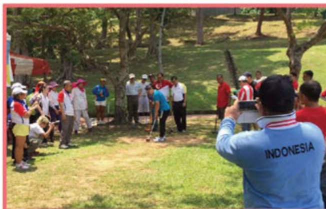
16th Singapore Lion City Cup International Woodball Open Championship 2016 2016年第十六屆新加坡獅城盃國際木球公開賽 Clementi Woods Park, Singapore 5 - 8 Aug. 2016