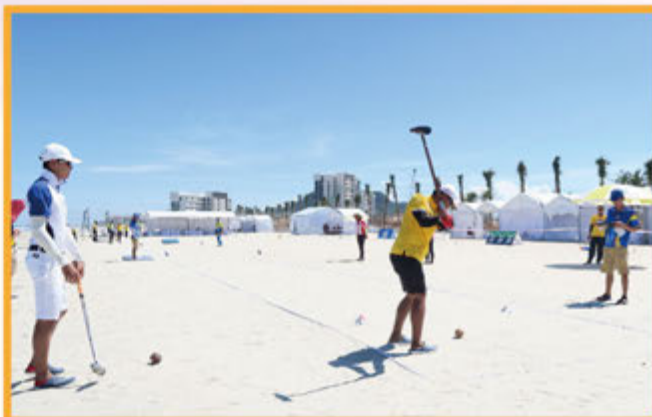
5th Danang Asian Beach Games 2016 2016年第五屆峴港亞洲沙灘運動會 Danang, Vietnam 24 Sep. - 3 Oct. 2016