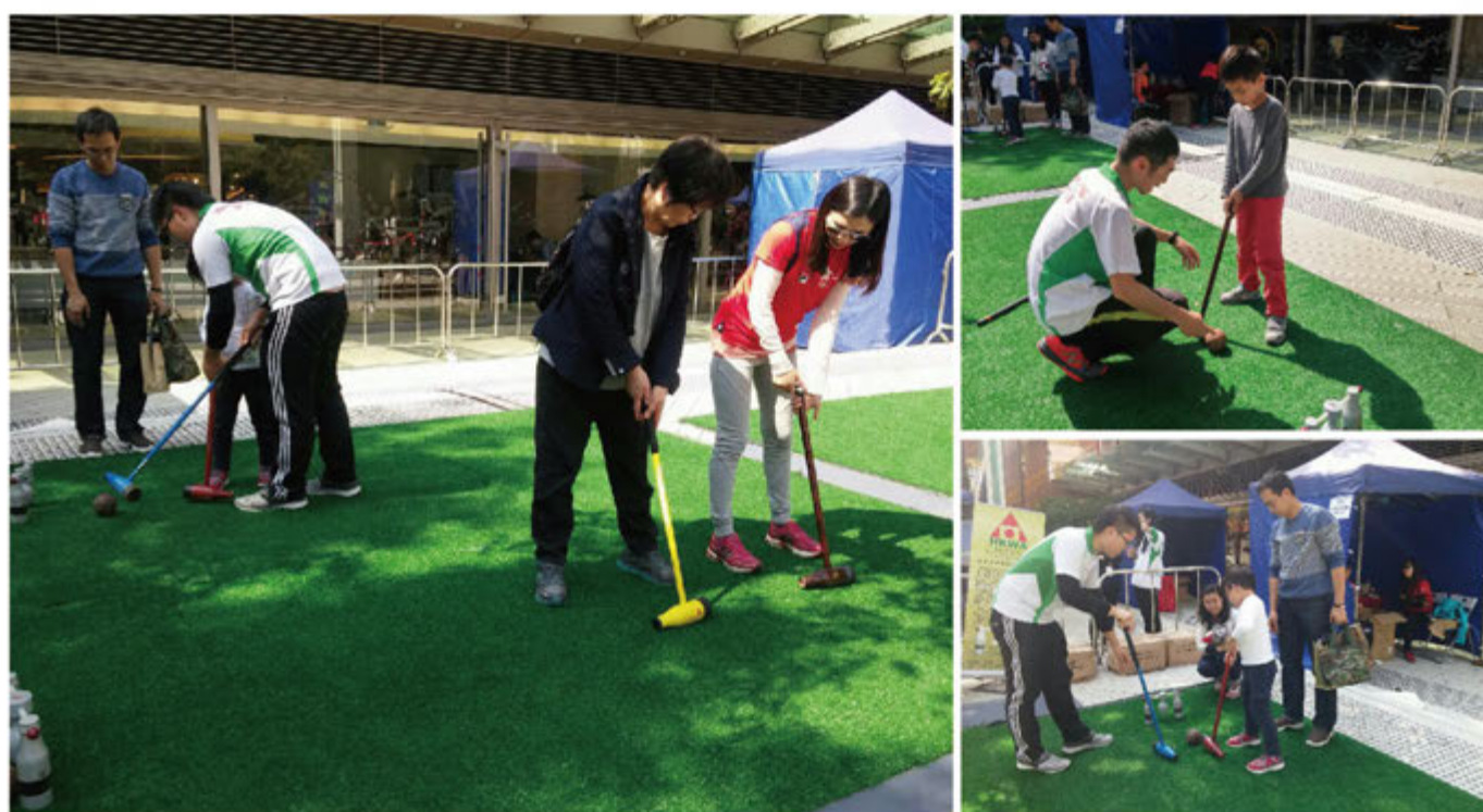
The Woodball Training Camp, 28 February 2016