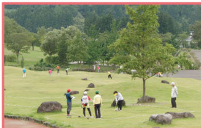
15th Japan Open International Woodball Championship 2016 2016年第十五屆日本國際木球公開賽 Fukushima, Japan 17 - 18 Sep. 2016