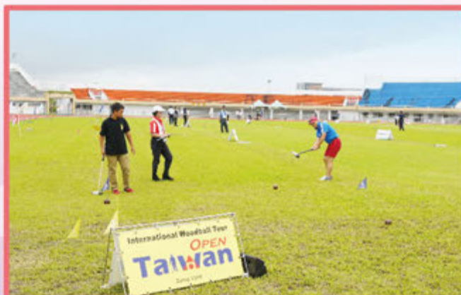
21st Taiwan Open International Woodball Championship 2016 2016年第二十一屆臺灣國際木球公開賽 Yilan, Taiwan 27 Oct. - 1 Nov. 2016