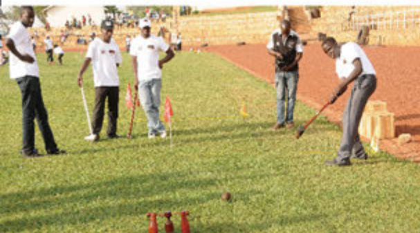
8th Coral Coatings Woodball Open, Uganda Christian University, Mukono, 29-30 October