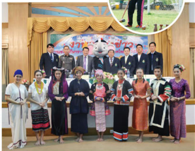
Inter Mountain Peoples Sport Games 2016