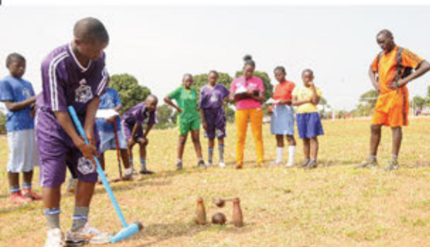
Buganda Schools Woodball Championship, Buddo Secondary School, 29 July 2016