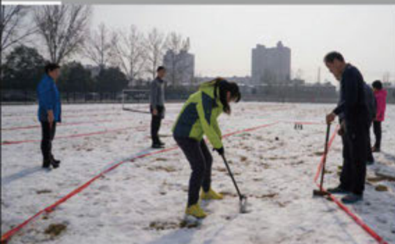
2nd Shangqiu Snow Woodball Friendship Tournament, Shangqiu, China, 24 November 2016