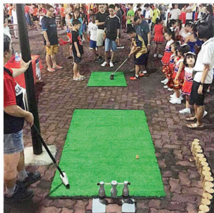
Woodball Demonstration on West Coast Singapore 60th Earth Hour Day, 19 March 2016