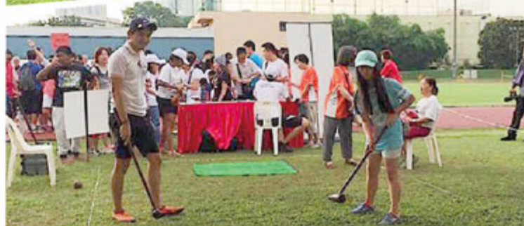
Woodball Sport Try Out on West Coast Community Sports Day, 23 July 2016