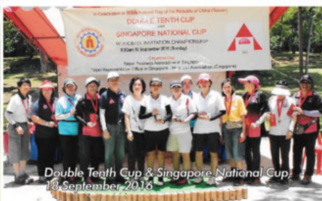
Double Tenth Cup & Singapore National Cup, 18 September 2016