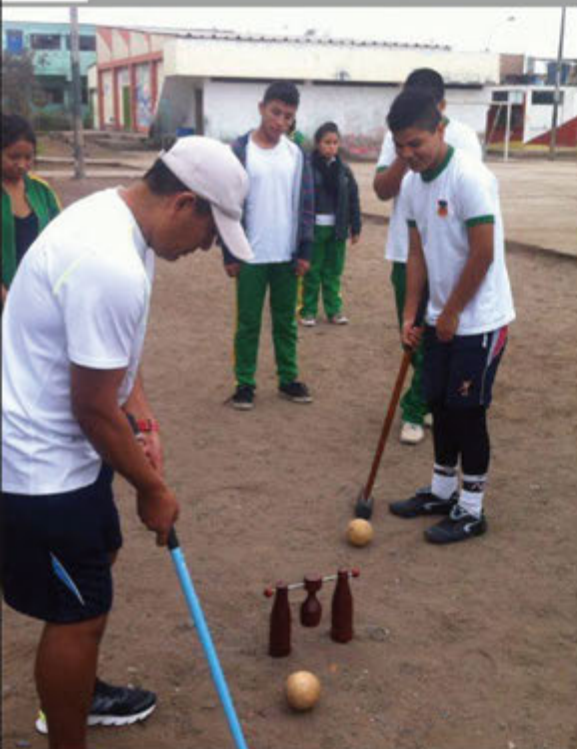
Woodball Training Camp in Swiss Peruvian school, Lima, Peru, August 2016