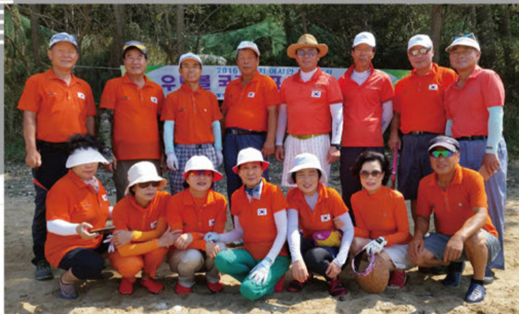
Mayor Cup of Ansan Woodball Championship 2016 Ansan Woodball Course, 7 May 2016