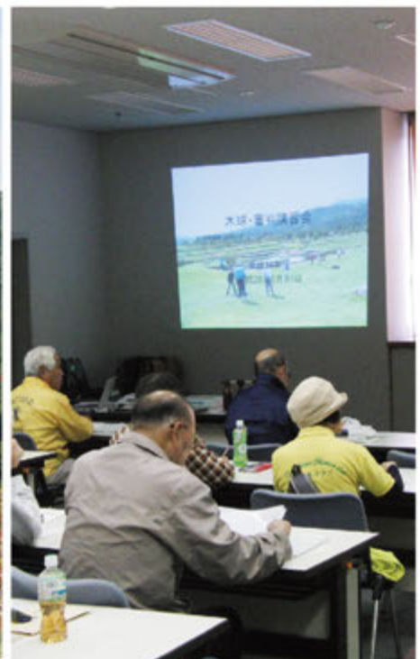
Referee Workshop 2016, Azuma Sports Park in Fukushima 21 May 2016