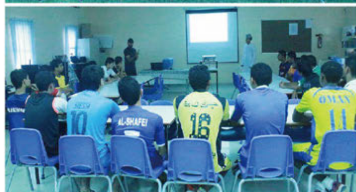
Woodball Game within the Council's Sports School, Sohar, 13 November, 2016