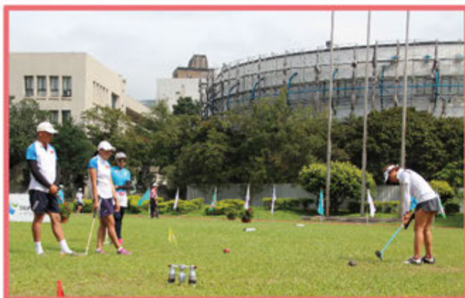
5th World University Woodball Championship 2016 2016年第五屆世界大學木球錦標賽 Taipei, Taiwan 22-27 Oct. 2016