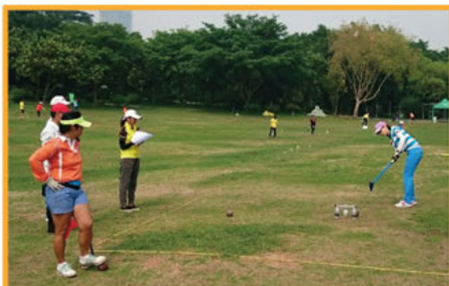
China Open International Woodball Championship 2016 2016年中國國際木球公開賽 ShenZhen, China 25 - 29 Apr. 2016