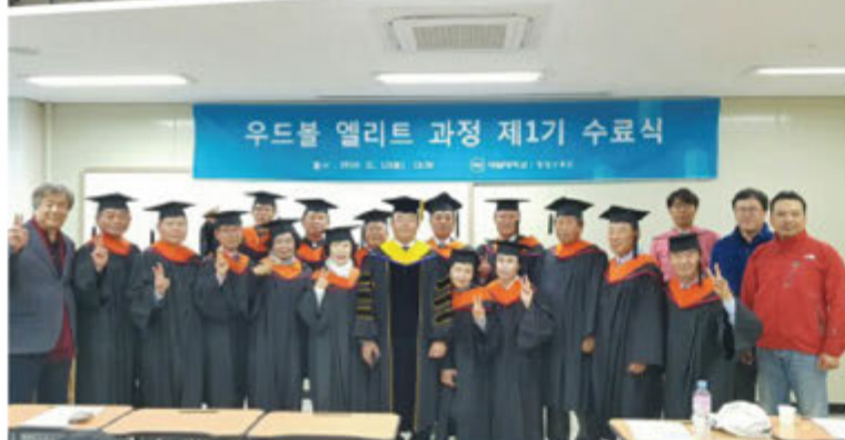
Woodball Elite Course Completion Daelim University Lifelong Education Center, 11 Nov. 2016