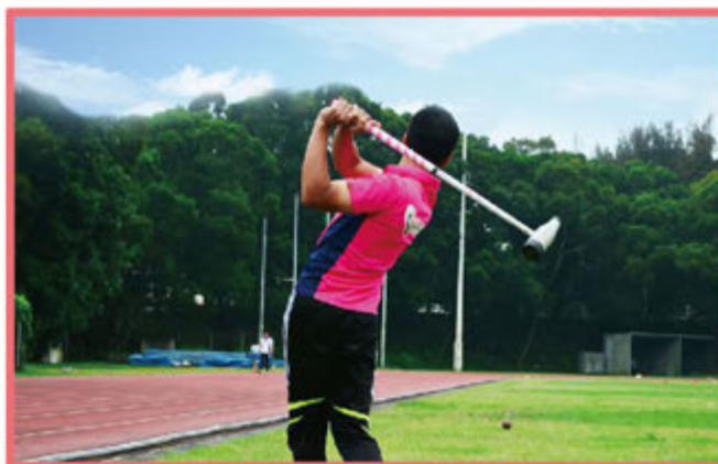
Hong Kong Open International Woodball Championship 2016 2016年香港國際木球公開賽 Hong Kong 30 Apr. - 1 May 2016