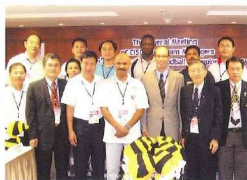
2nd World University Woodball Championship 2006 2006年第二屆世界大學木球錦標賽 26-28 Sep 2006 : Bangkok, Thailand