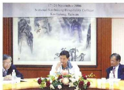
International Woodball Coach Workshop 2006 2006年國際木球教練講習會 17-20 Nov 2006 : Kaohsiung, Taiwan