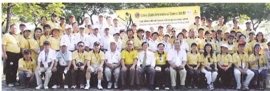
Cross Strait College Woodball Open Championship 2006 海峽兩岸高校木球夏令營 25~30 Aug 2006 : Beijing, China