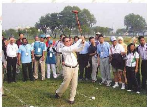
2nd World Cup Woodball Championship 2006 2006年第二屆世界盃木球錦標賽 22~24 Aug 2006 : Kuala Lumpur, Malaysia