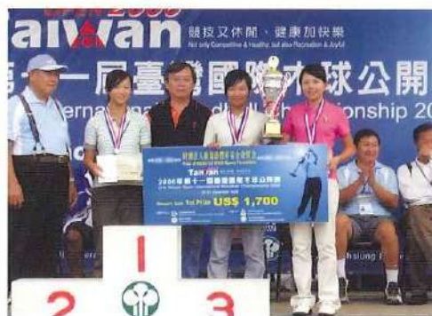
11th Taiwan Open International Woodball Championship 2006 2006年第十一屆臺灣國際木球公開賽 16-21 Nov 2006 : Kaohsiung, Taiwan