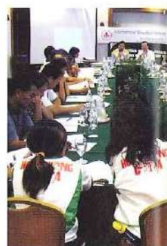
International Woodball Referee Training 2006 2006年國際木球裁判講習會 22~25 Aug 2006 : Kuala Lumpur, Malaysia