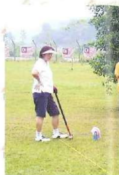
2006 Malaysia Woodball Open Championship 22~24 Aug 2006 : Kuala Lumpur, Malaysia