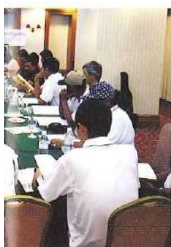
Woodball Workshop 2006 Kuala Lumpur, Malaysia