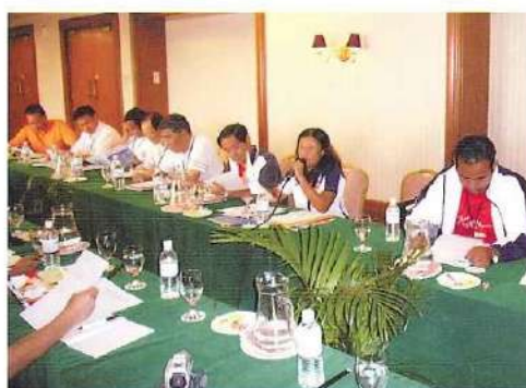
Provisional Meeting of International Woodball Federation 2006 2006年國際木球總會臨時會員大會 24~26 Aug 2006 : Kuala Lumpur, Malaysia