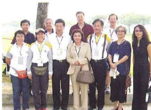
5th Japan Open International Woodball Championship 2006 第五屆日本國際木球公開賽 21~22 Oct 2006 : Fukushima, Japan