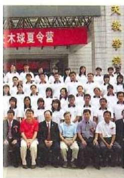
Woodball Summer Camp Kuala Lumpur, Malaysia