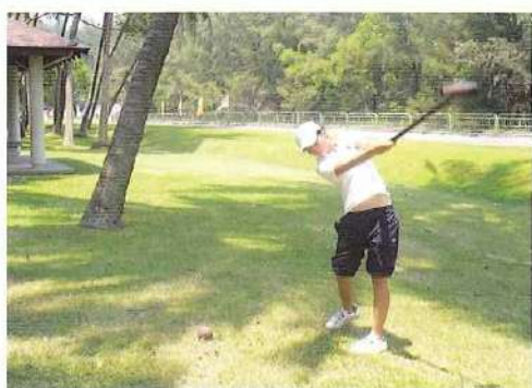
7th Singapore Lion Cup International Woodball Open Championship 2006 2006年第七屆新加坡獅城盃國際木球錦標賽 15~20 Aug 2006 : East Coast Park, Singapore