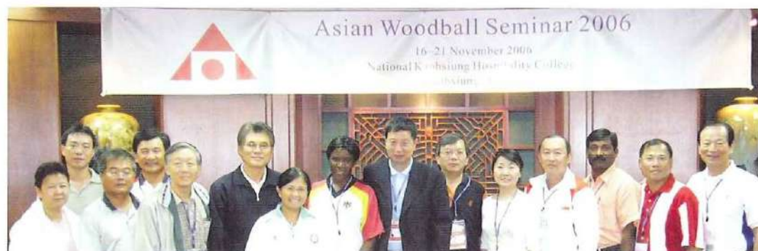
Asian Woodball Seminar 2006 2006年亞洲木球研討會 18-20 Nov 2006 : Kaohsiung, Taiwan