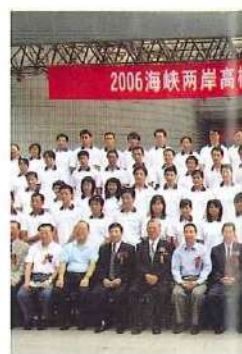
Cross Strait College Woodball Open Championship 2006 海峽兩岸高校木球夏令營 25~30 Aug 2006 : Beijing, China