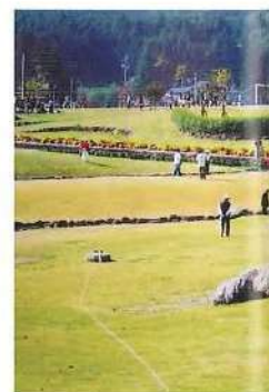
1st Lions Clubs International District 308B1 Woodball Open Championship 2006 2006年第一屆國際獅子會308B1區木球公開賽 15~19 Jun 2006 : Kuala Lumpur, Malaysia