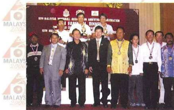
10th Malaysia Woodball Association Anniversary Celebration 10th Malaysia Woodball Association Anniversary Dinner 22~24 Aug 2006 : Kuala Lumpur, Malaysia