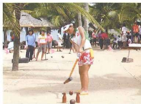
International Woodball Referee Workshop 2011 2011年國際木球裁判講習會 21-24 July; Perlis, Malaysia