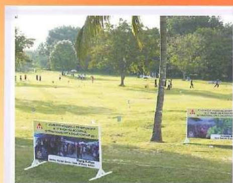
Venue of the 7th Asian Cup Woodball Championship 2011 2011年第七屆亞洲盃木球錦標賽比賽場地