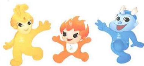
Mascots of the 3rd Asian Beach Games Haiyang 2012 2012年第三屆海陽亞洲沙灘運動會吉祥物

At present, ten teams enrolled in the Beach Woodball Discipline, including China, Mongolia, Chinese Taipei, Iran, Oman, Indonesia, Malaysia, Philippines, Thailand, and Vietnam. For more game information, please visit the official website, http://www.haiyang2012.com/en .