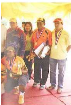
Woodball Championship 2011