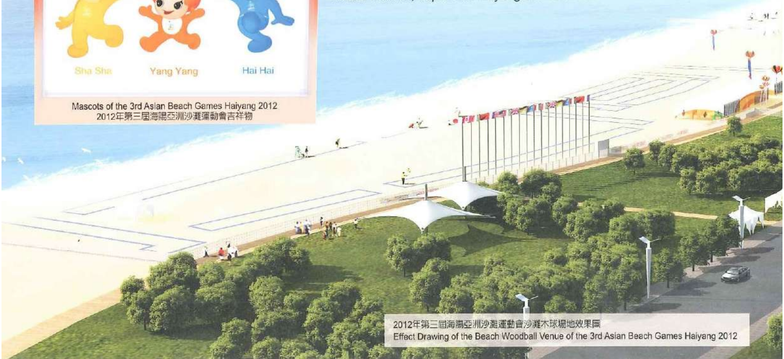
2012年第三屆海陽亞洲沙灘運動會沙灘木球場地效果圖 Effect Drawing of the Beach Woodball Venue of the 3rd Asian Beach Games Haiyang 2012

At present, ten teams enrolled in the Beach Woodball Discipline, including China, Mongolia, Chinese Taipei, Iran, Oman, Indonesia, Malaysia, Philippines, Thailand, and Vietnam. For more game information, please visit the official website, http://www.haiyang2012.com/en .