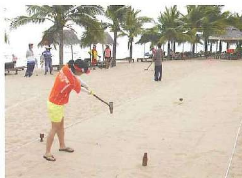
Thailand Air Sea Land Beach Woodball Championship 2011 2011年泰國空海陸沙灘木球公開賽 3-7 May; Pattaya, Thailand